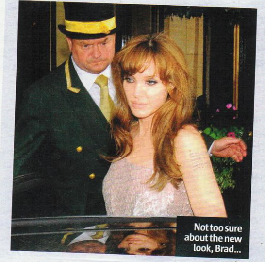
Treat yourself to a stay in a top hotel!